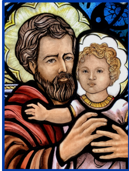
Close-up of the stained glass window of Saint Joseph (Memorial—March 19) and the Child Jesus in the Center's Chapel of Our Lady of Guadalupe Saint Joseph, pray for us!