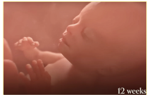
Screen shot courtesy of LiveAction.org